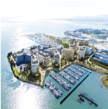
Kilroy Oyster Point (South San Francisco)